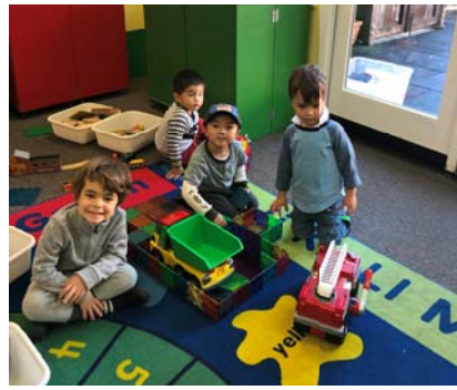
Miss Susie's preschoolers doing what preschoolers do best - play!