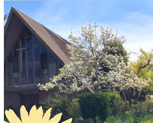
By Sharon Tissue

Sign-up sheets for flowers and coffee for January, 2020 - June, 2020 are on the table in CFM. Pick your dates early!