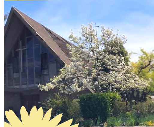
By Sharon Tissue

October 14 - Columbus Day October 17 - 9:00 a.m. CFM Women's Bible Study October 23 - Loaves & Fishes, Pittsburg; 9:30 a.m. and also 7:00 p.m. 'Sanctuary' Listening Post, CFM Conference Room; 10:30 a.m. HSCP Pumpkin Patch Field Trip October 28 - 6:00 - 10:00 p.m. Chromatica Concert Rehearsal, Sanctuary October 30 - 11:30 a.m. HSCP Halloween Parade, Gregersen Hall; 7:00 p.m. CFM Breaking Bread Lecture October 31 - Halloween November 3 - Daylight Saving Time Ends 3:00 p.m. Chromatica Concert November 6 - 9:30 a.m. and also 7:00 p.m. 'Sanctuary' Listening Post, CFM Conference Room November 11 - Veterans Day November 28 - Thanksgiving Day