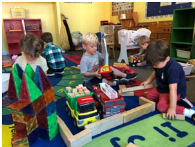
Preschoolers having fun with magna tiles.