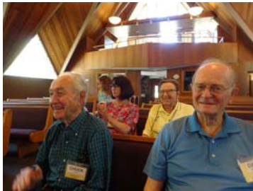
Enjoying the VBS Kids!

Curious? Join us at 5:15 pm – and bring a friend!