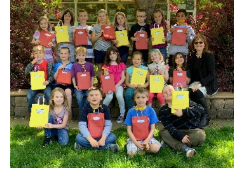
The children in Paradise say "thank you" for their new books!

Holy Shepherd Lutheran Church April 21, 2019 www.holyshepherd.org Office Hours 8:30 a.m. - 2:00 p.m. Monday - Thursday Phone 925-254-3422