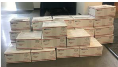
Pete Schmitt's Easter mailing ready to go to our troops. Thank you all for your