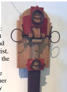
Mary Helene Wagner Displayed in Sanctuary

"Cross of Three Nails" contains a set of symbols: The three nails represent those used at the hands and feet of the crucified Christ. The four circles represent the four gospels. The small column of three circles, the Trinity. Assembled together they form a contemporary rendering of a crucifix.