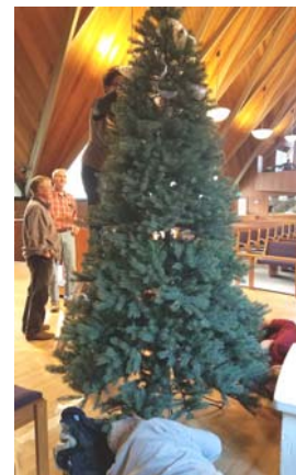
Background: Pete & Gerry Under the tree: Tom & Lyndel On ladder: Louise