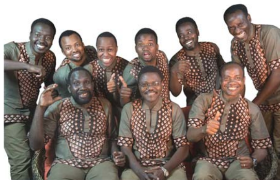
40th Anniversary New Life Band 2018 California Tour Traditional & Contemporary Gospel Music of Tanzania