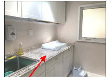
After the upgrade!