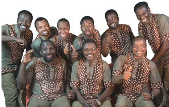
40th Anniversary New Life Band 2018 California Tour Traditional & Contemporary Gospel Music of Tanzania