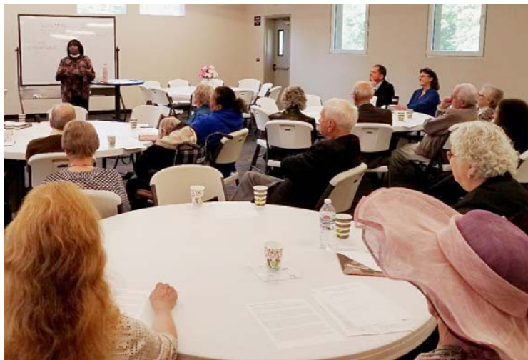
Adult Education with Dinah Washington