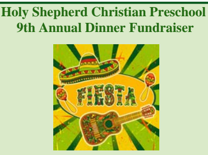
Saturday, April 21, 5:30 - 9:00 p.m.

March 26 - 10:00 am College Care Package Mailing CFM