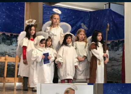
Holy Shepherd kids in the Christmas Pageant presented last Sunday!

TODAY - 9:30 am Annual Advent/Christmas Music Celebration December 18 - January 1 Preschool Closed December 19 - 7:00 pm Church Council December 24 - 9:30 am Worship Service Christmas Eve Services at 4:00 pm, 6:00 pm and 10:00 pm December 25 - January 1 - LARC Closed January 4 - 9:00 am Women's Bible Study meets in CFM January 21 - 12:15 pm, Bible & Lunch Bunch, Location to be determined